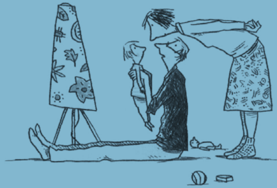
Philip Waechter, Sonntag © 2008 Beltz & Gelberg in der Verlagsgruppe Beltz, Weinheim/Basel